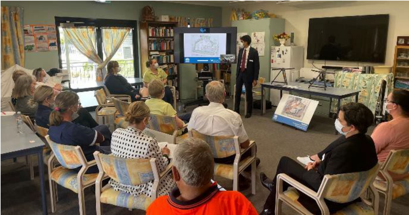
Above: Staff information session, October 2022