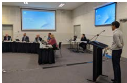
Blayney Shire Council presentation, July 2023