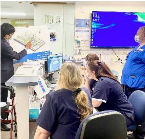
Left: Staff information session, October 2022