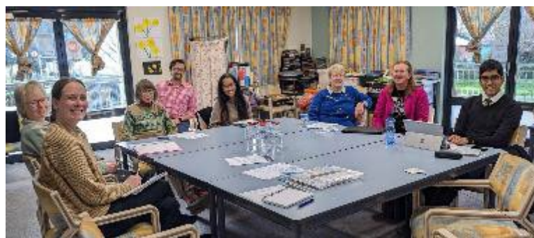
Arts Working Group, July 2023