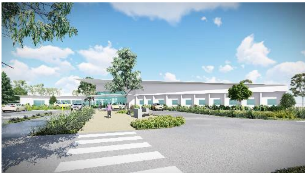
Blayney MPS Redevelopment: Artist's Impression: Concept Design

This section outlines how the Blayney MPS Redevelopment project is strategically and proactively engaging the community and key stakeholders including staff and residents, Blayney Shire Council, and key community groups – from planning and design through to construction. The below information is extracted from our engagement tracker which records all internal and external stakeholder engagement activities to date