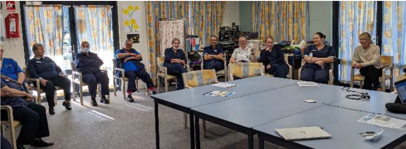
Below: Staff information session, July 2023