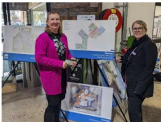
Community pop-up session, July 2023