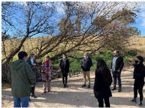
Walk on Country, August 2022