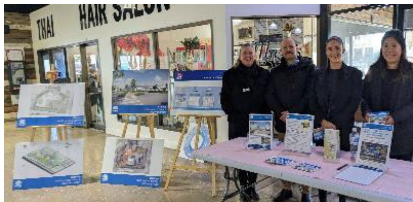
Community pop-up session, May 2022