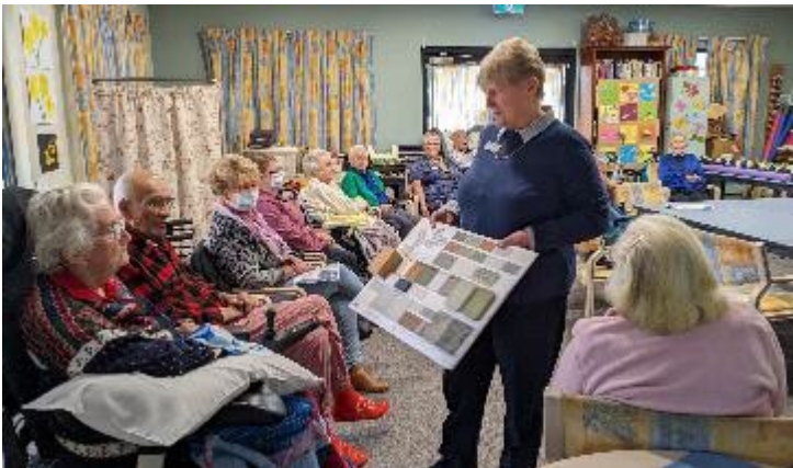
Above: RAC residents & families information session, July 2023