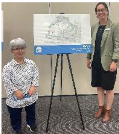
Community drop-in session, October 2022