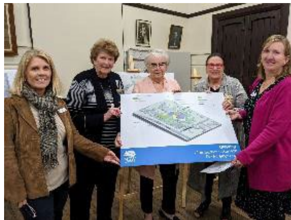
Blayney View Club presentation, November 2022