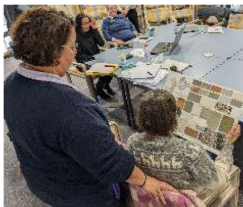
Aboriginal Focus Group, July 2023